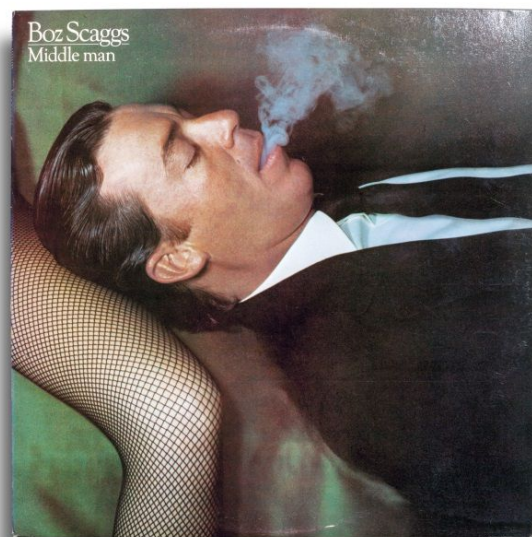
Vinyl: Boz Scaggs, Middle Man , Columbia FC 36106, United States, 1980. Photography: Guy Bourdin. Courtesy from The Guy Bourdin Estate, 2015.