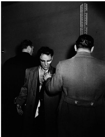
Foto Colectania presents 'Weegee by Weegee' An exhibition of the most obscure chronicler of New York in the 30s and 40s

One of the world's most important private collections of Weegee's photographs arrives in Barcelona