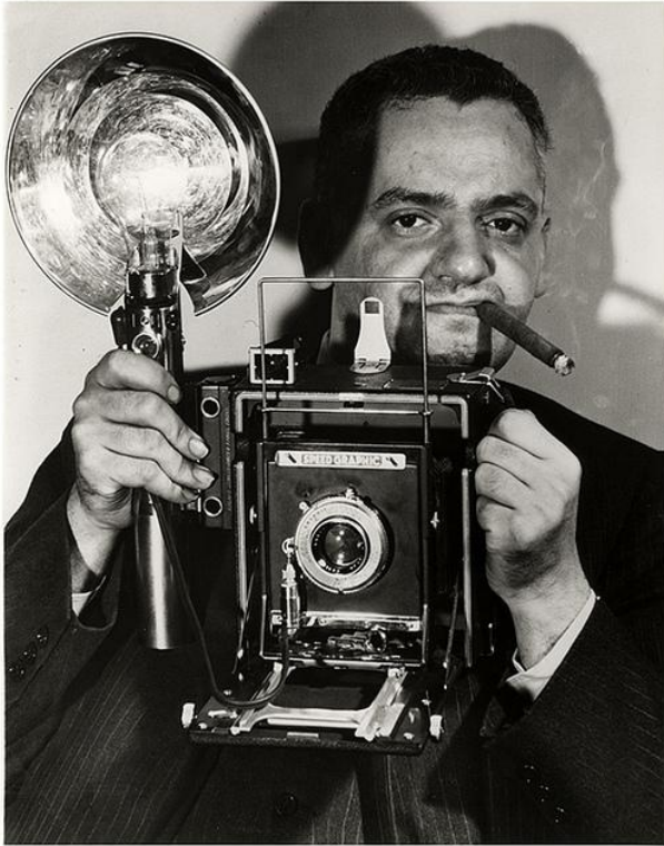
Arthur "Weegee" Fellig, A Self Portrait

Arthur H. Fellig (Zloczwe, now Ukraine, 1899-New York, 1968) was a photojournalist who worked for media and agencies such as the Acme Newspictures, where it is said that he was named "Weegee", a motto derived from "ouija", in allusion to his supposed ability to communicate with the dead. He started working in a crime-ridden New York and indeed, he is a very cinematographic photographer.