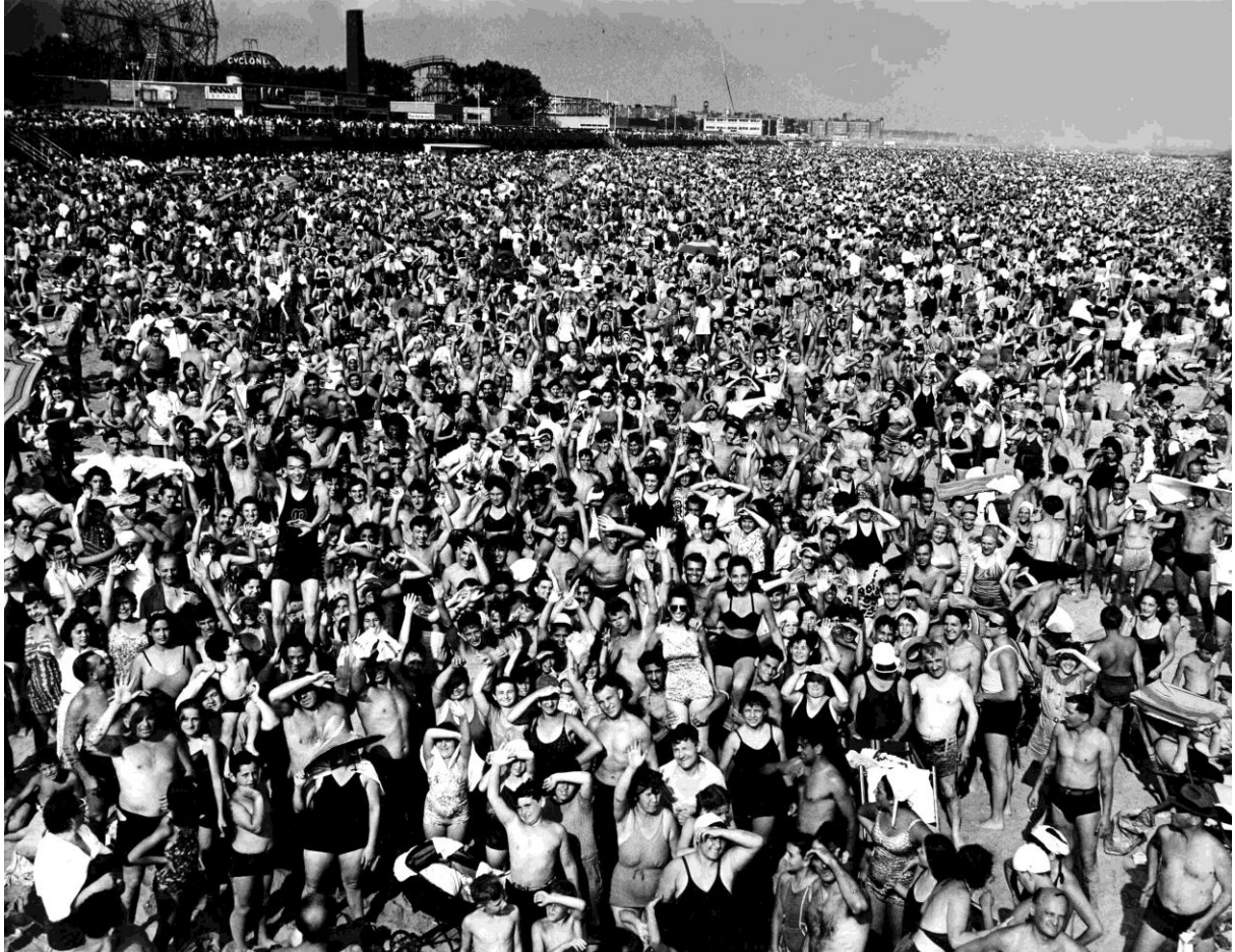
Coney Island Beach, 1940.

Press Release Weegee by Weegee July 5th | November 5th 2017